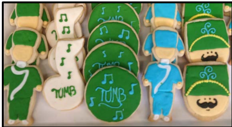
The Greenie Gals baked these custom cookies for band camp, plus a lasagna dinner for everyone in the TUMB.

Graves awards were presented to 26 TUMB members in fall 2014. That brings the total to 187 awards granted over nine semesters since this fund was established. Thank you to our generous donors who make it possible for band students to put in the long hours and develop their leadership skills, making the TUMB the best it can be.