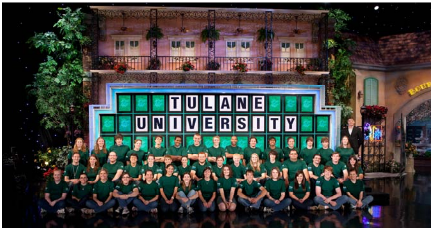
TUMB was featured on Wheel of Fortune's College Week, which taped in New Orleans last Spring and aired internationally May 9-13, 2011!