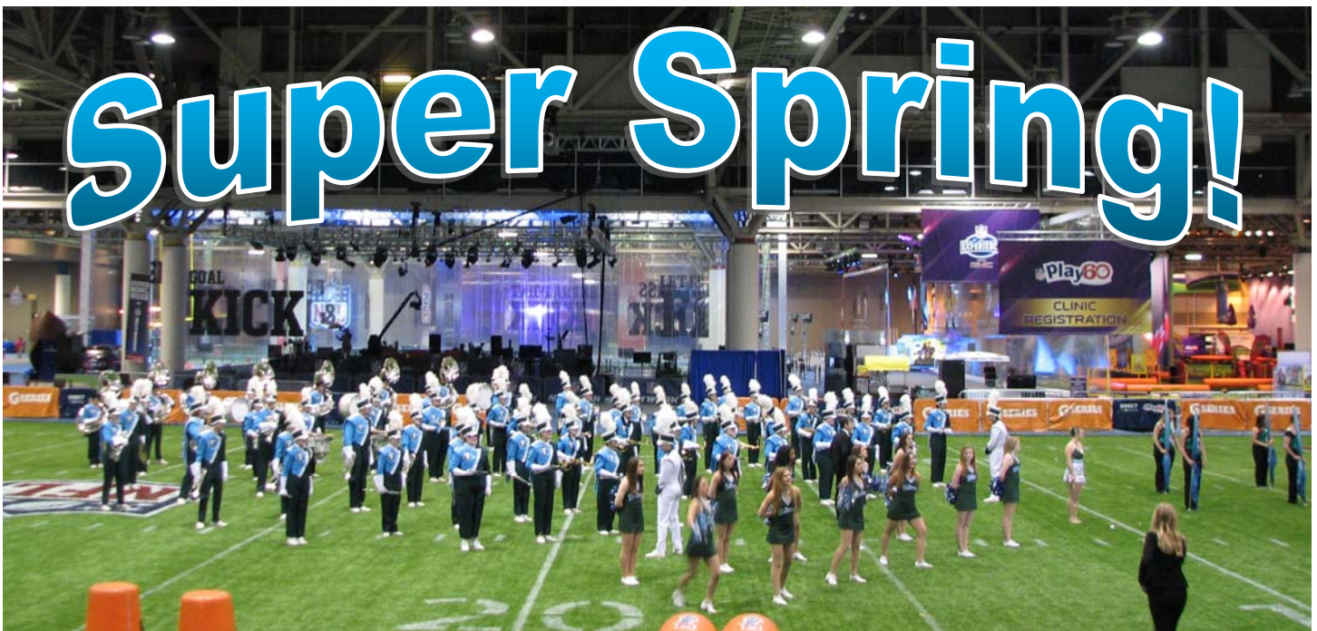
TUMB performs as the "house band" for Fox & Friends broadcast, live from the Morial Convention Center for Super Bowl XLVII.

"Only in New Orleans, Only at Tulane" is a reality: members of the TUMB have experienced an incredible Spring 2013 semester, one that no other college band can claim. As New Orleans hosted a record 10 th NFL grand finale - Super Bowl XLVII - the city filled with media from around the world. The TUMB was ready for its close-up with an audience of more than 100 million television viewers and tens of thousands more at live events.