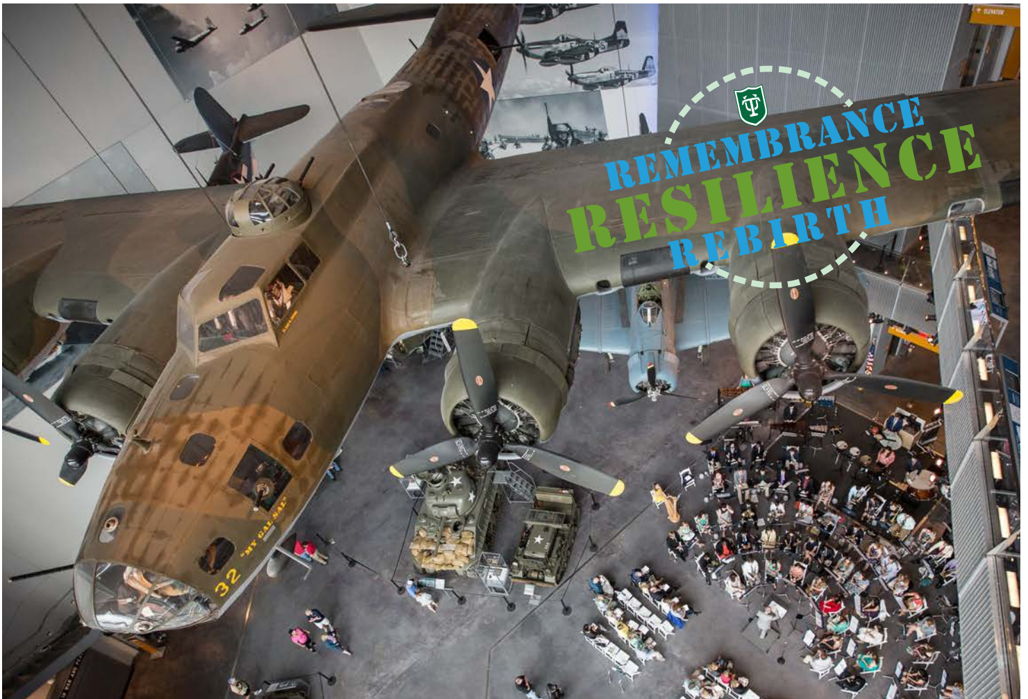
THE TULANE CONCERT BAND presented a special concert at the National World War II Museum on April 17. Repertoire included music from movies about World War II: Victory at Sea and Band of Brothers . The band is pictured above, performing in their concert arcs, under the aircraft suspended above them. Full story on page 4.